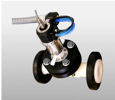
EXconnect connected to retractable probe housing