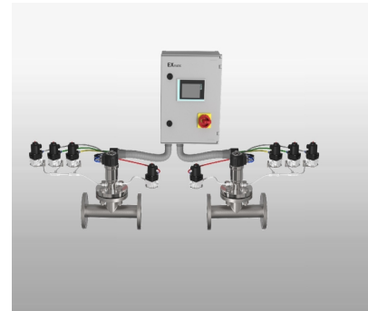
Measuring point with probe housings, flow-through fittings and control unit