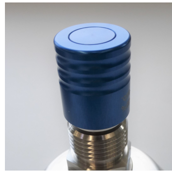
EXspect 271 with reference normal EXcap 120