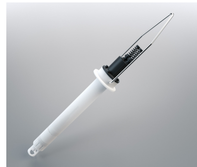
EXdip 920 - version with suspended holder