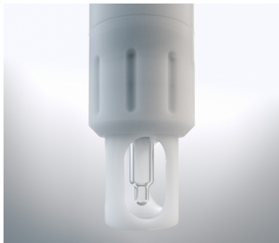
Cleaning nozzles integrated in the protective cage of EXdip 920