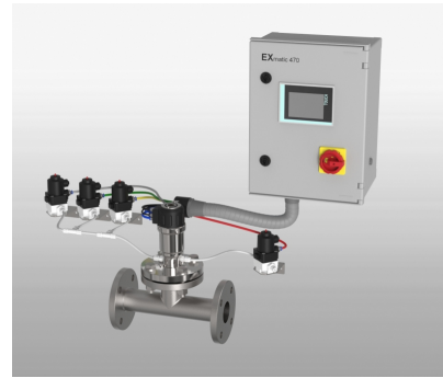
Measuring point with probe housing, flow-through fitting and control unit