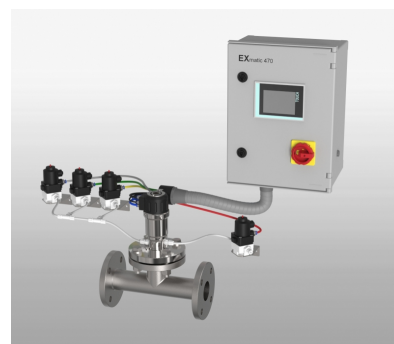
Measuring point with probe housing, flow-through fitting and control unit